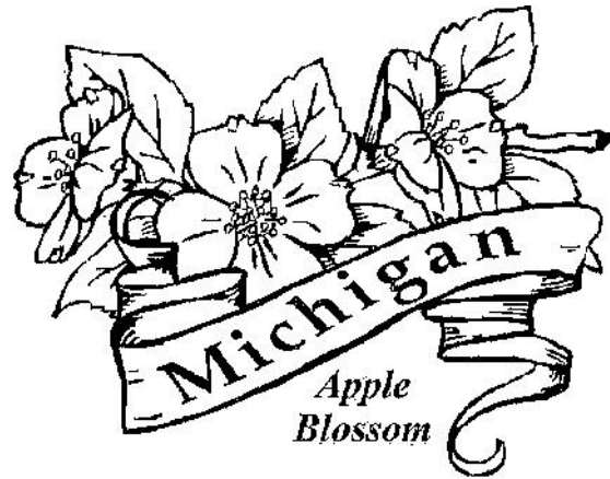
Michigan State Flower: Apple Blossom