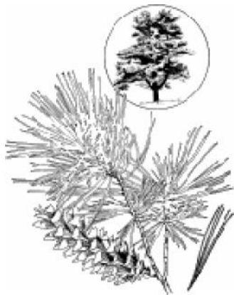
Michigan State Tree: White Pine