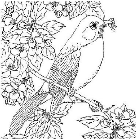
Michigan State Bird: American Robin