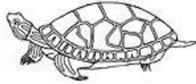
Michigan State Reptile: Painted Turtle