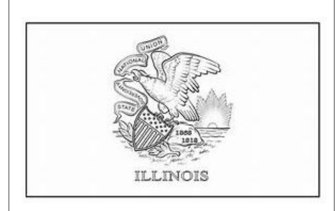
Illinois 21st State

Illinois State Motto: State Sovereignty, National Union