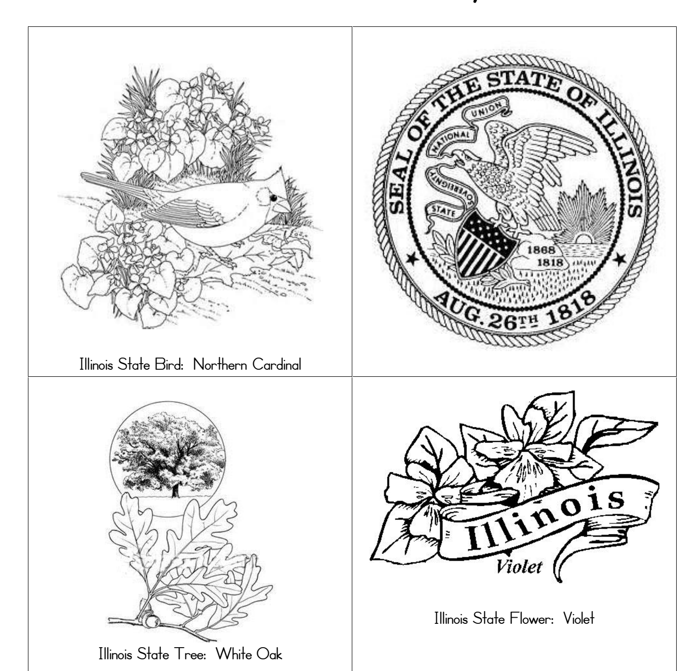
A to Z Kids Stuff http://www.aozkidsstuff.com