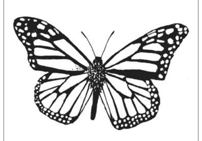
Illinois State Insect: Monarch Butterfly