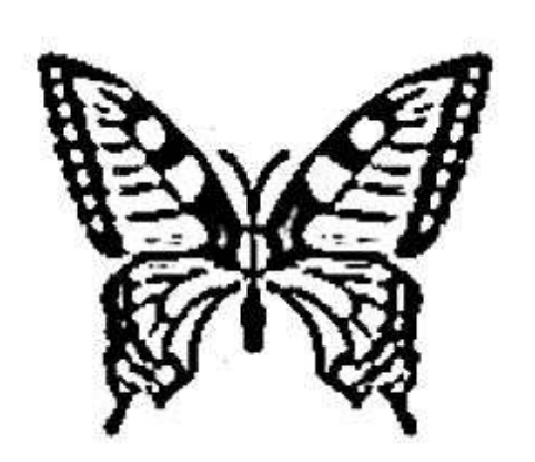
Oregon State Butterfly: Oregon Swallowtail Butterfly