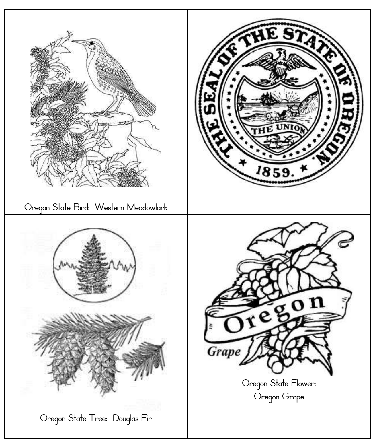
A to Z Kids Stuff http://www.aozkidsstuff.com